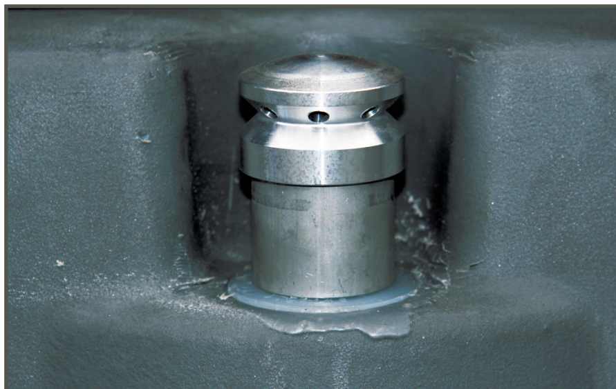
Splash Resistant Breather