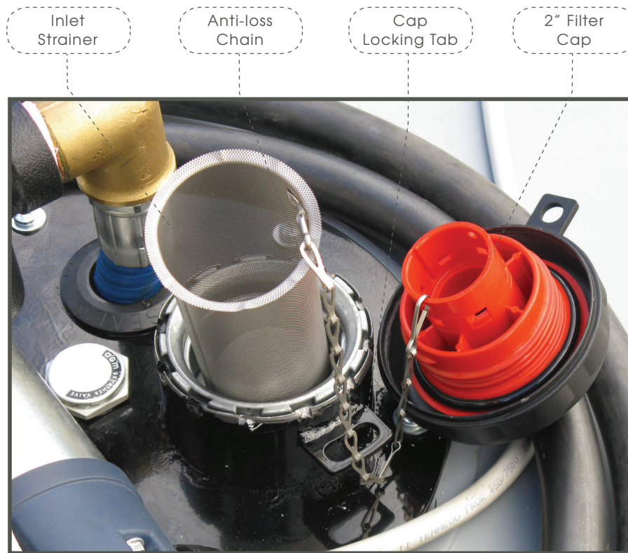
Padlockable , Non-vented diesel filler lid with strainer and anti loss chain