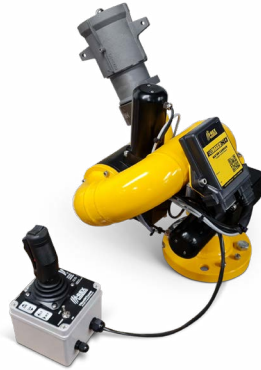
Manual Adjustable Fog Nozzle