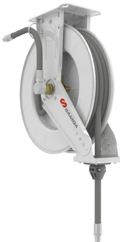
Reel with arms in ceiling mounting position.