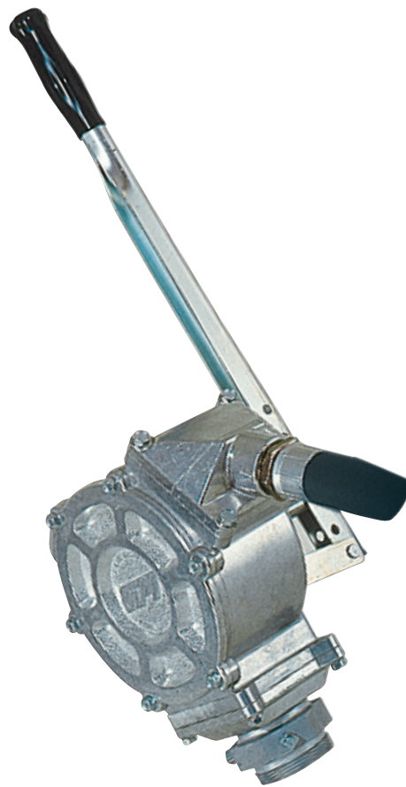
PM GPI PISTON