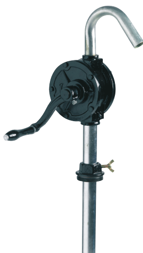
CAST IRON ROTATIVE