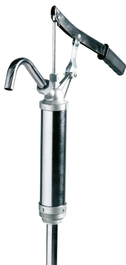
PISTON HAND PUMP