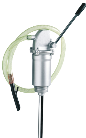
PISTON HAND PUMP